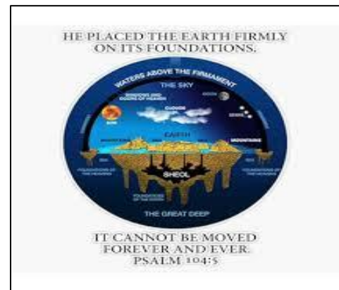
Figure 2 - Heaven and earth in antiquity

How do we then understand the firmament? Only God can truly answer that, however, I believe that the firmament described in Genesis 1:6-18 is merely expanding Genesis 1:1 into more detail, but from mankind's vantage point as we look up into the sky (physical heaven or Universe). God does not describe the Universe in precise detail due to its vastness and complexity as I do not believe it was necessary for God's followers to lose themselves in the precision of scientific data, besides, the cosmology in antiquity was pretty basic. Without the advantage of telescopes and spaceships, the image they compiled by merely using the scriptures and observation of the sky is pretty accurate, but of course, they missed Job 26:7 that says the earth hangs on nothing, and they misunderstood that the sun revolves around the earth instead of the other way round, see Joshua 10:12-14 where the sun stood still, i.e. they did not understand that it was the earth that stood still because from their vantage point, the sun appeared to be moving, hence, why Figure 2 is what they came up with.